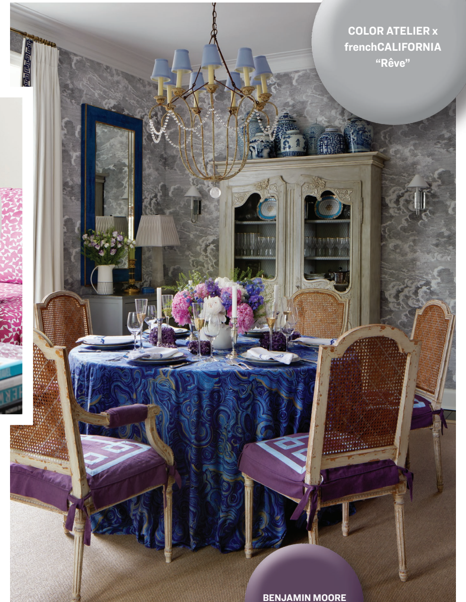
COLOR ATELIER x frenchCALIFORNIA "Rêve"